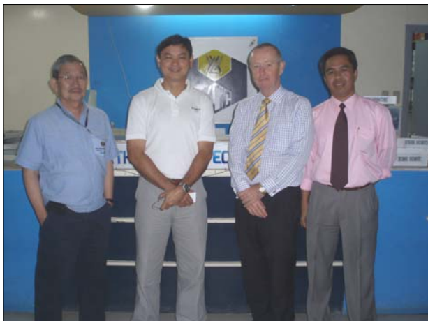
FIGURE 2. Ayala Land Executives with Radcrete's Mr Rorke (second from right)

The complex is now in operation with the exception of two buildings due for completion in early 2010.