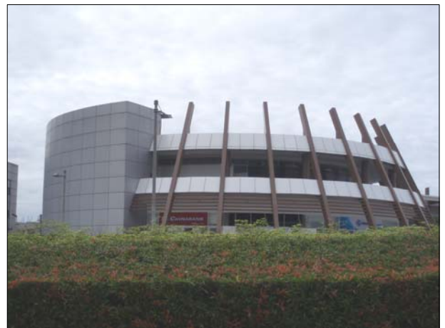
FIGURE 3. The retail buildings and restaurants.

EXCLUSIVE GLOBAL DISTRIBUTOR FOR RADCON FORMULA#7 WATERPROOFING CONCRETE FOR LIFE